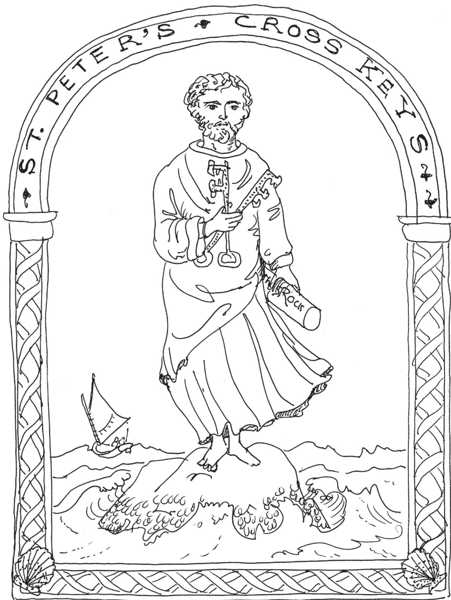
St. Peter's Cross Keys July 2006